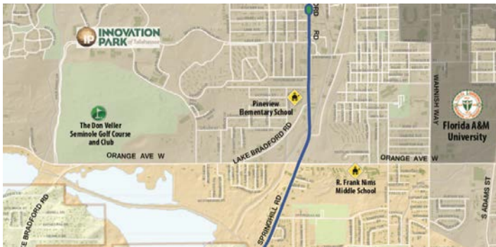
Airport Gateway: Springhill Road and Lake Bradford Road