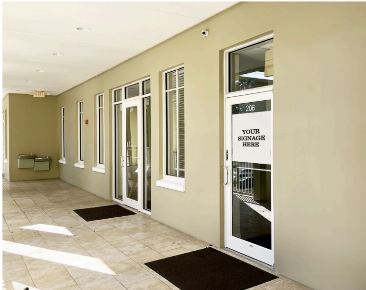
2nd floor Landing