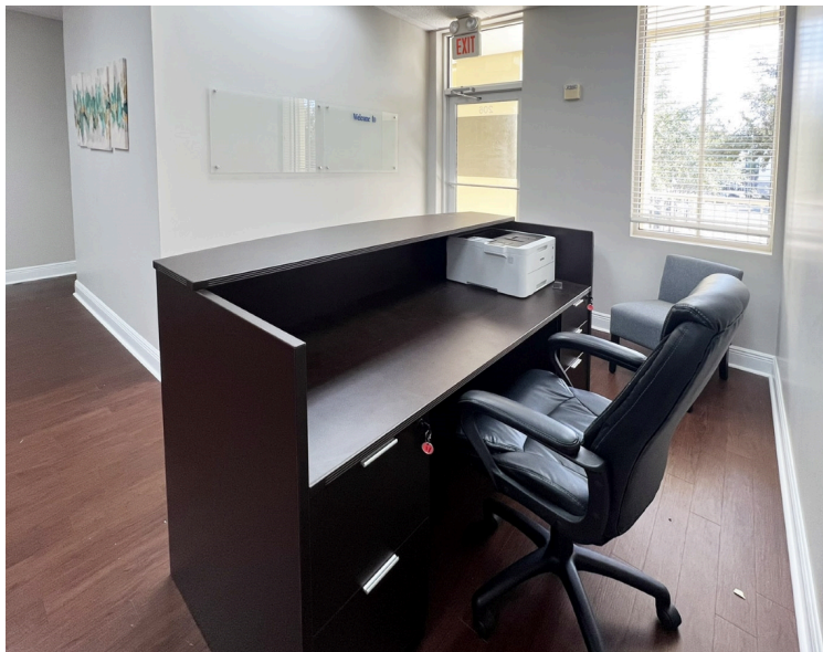
Hudson 206 Reception