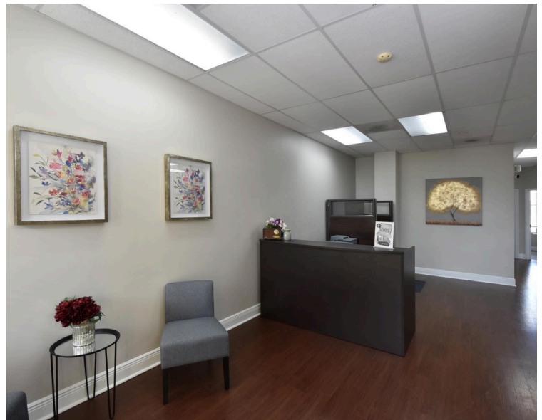
Hudson 206 Entry

Market: Tampa/St. Petersburg Submarket: Pasco County Available: 1,236 SqFt Space Type: Mixed Use Year Built: 2007