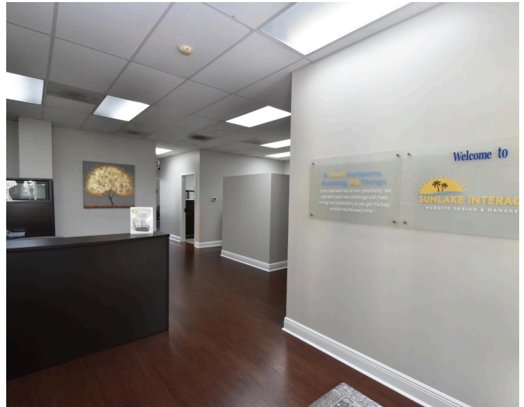
Hudson 206 Interior