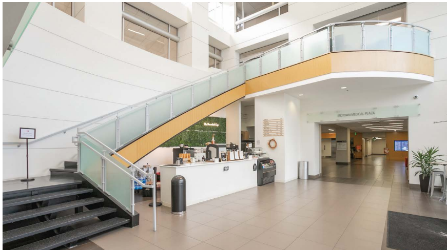
Interior lobby and onsite dining options create a welcoming experience for patients and guests.

Building owned and managed by HEALTHCARE REALTY