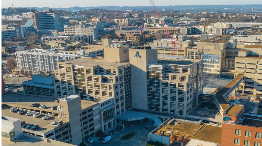
Experience specialty care at Midtown Medical Plaza, minutes from Downtown Nashville.

Midtown Medical Plaza | 2004 Hayes St | Nashville, TN | 37203