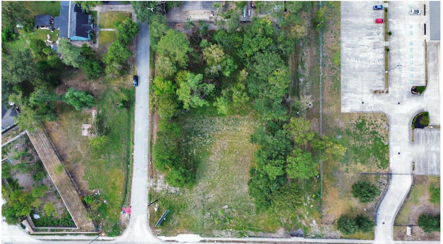
Flat, rectangular lot.