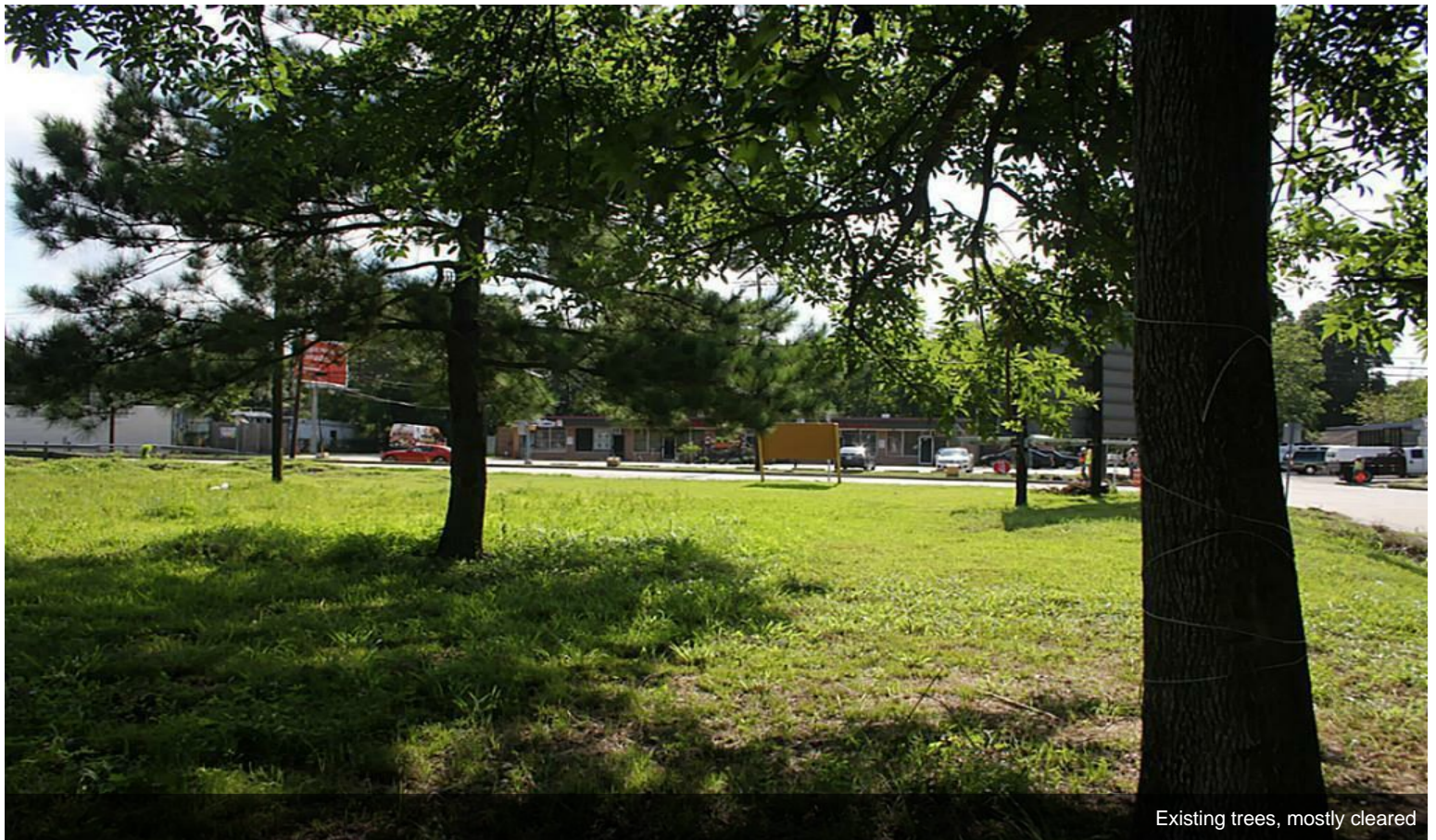
Existing trees, mostly cleared