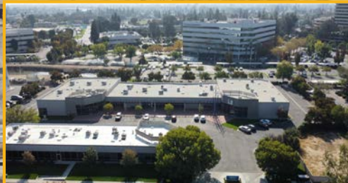
5143 Office Park Drive

5143 Office Park Drive • Bakersfield, CA