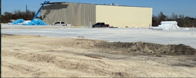
Construction Underway: First Building