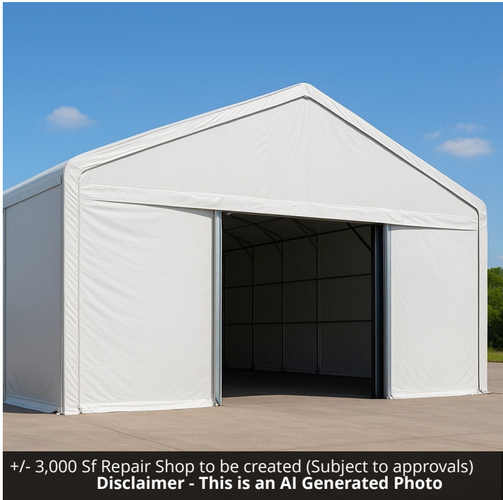
+/- 3,000 Sf Repair Shop to be created (Subject to approvals) Disclaimer - This is an AI Generated Photo