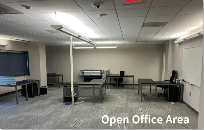
Open Office Area