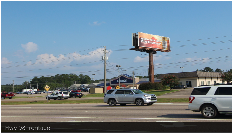
Hwy 98 frontage