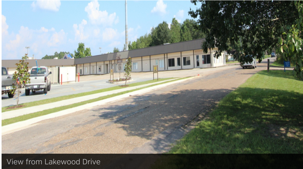
View from Lakewood Drive