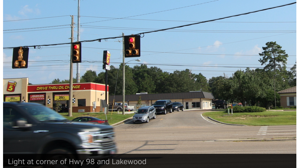
Light at corner of Hwy 98 and Lakewood