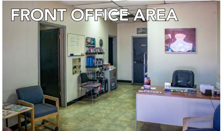
FRONT OFFICE AREA