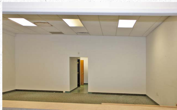
7400 WOODBURY RD. SUITE C