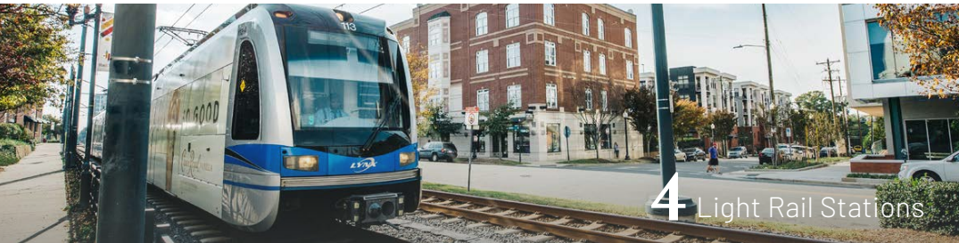
4 Light Rail Stations