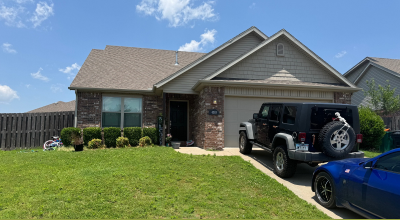
4303 Langmead Dr: 1,430