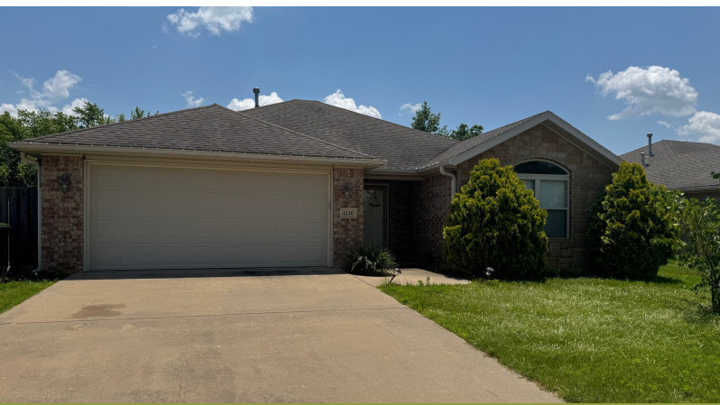
4310 Langmead Dr: 1,445