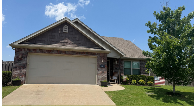
4301 Langmead Dr: 1,430