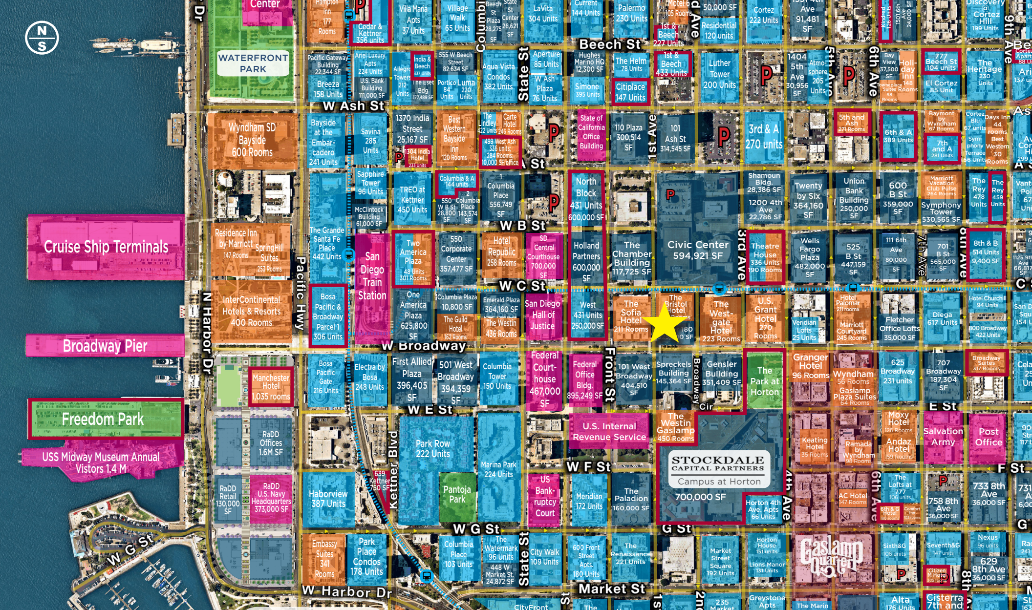
AERIAL USE MAP