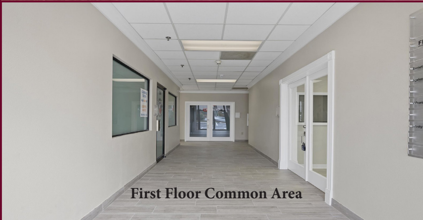
First Floor Common Area