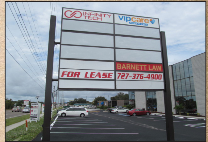
Updated Monument Sign