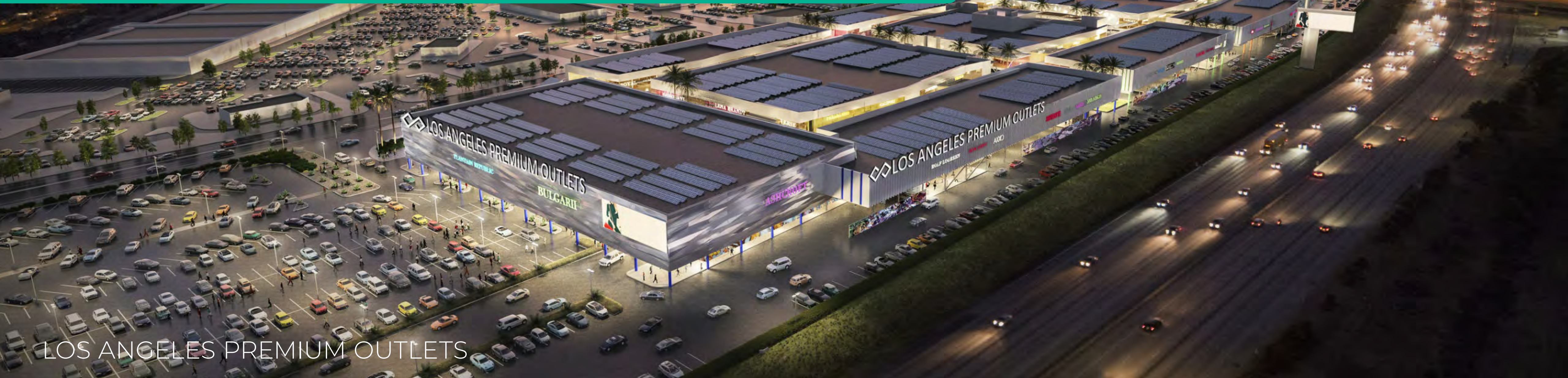
LOS ANGELES PREMIUM OUTLETS

Macerich and Simon are currently developing the Los Angeles Premium Outlets, a state-of-the-art premium outlet center. The first phase is designed to open with 400,000 SF, followed by an additional 166,000 SF in its second phase. Los Angeles Premium Outlets will be located in Carson in LA County and take advantage of its positioning west of the I-5 corridor and south of the I-10 Freeway.