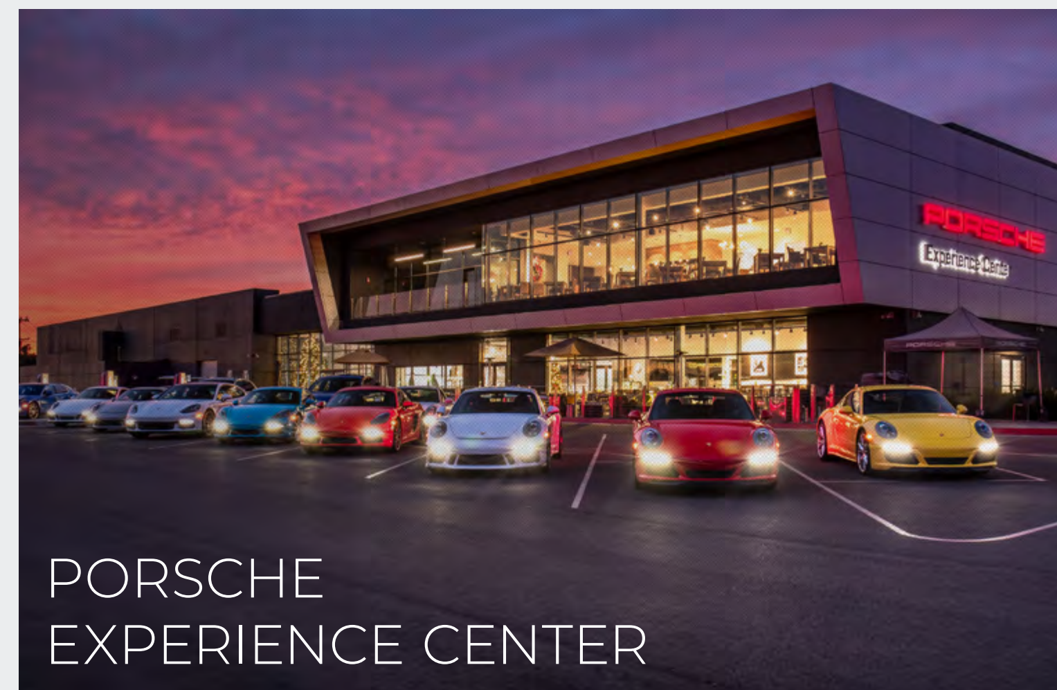
PORSCHE EXPERIENCE CENTER

The city has more than 120 acres of park land divided into 12 parks, 2 mini-parks and sports/recreational facilities that include 3 swimming pools, a boxing center, a state-of-the art sports complex and the Carson Community Center. These facilities allow the residents of Carson to enjoy a variety of sports, recreational and cultural programs.