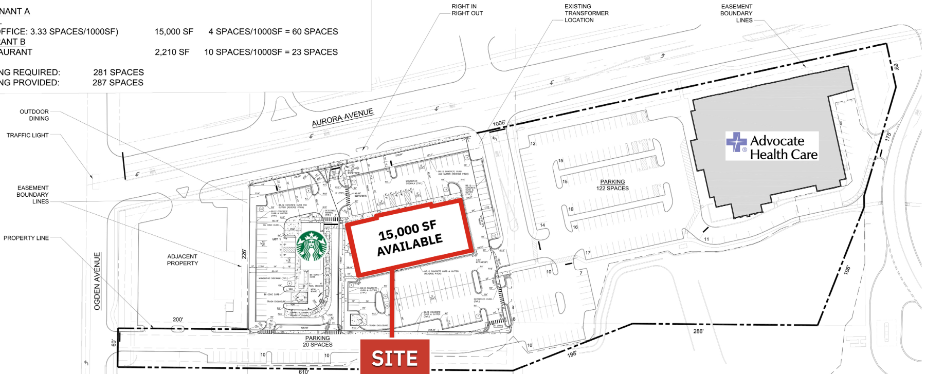
SITE PLAN OPTION B.1 SCALE: 1" = 100'

PARKING REQUIRED: 281 SPACES PARKING PROVIDED: 287 SPACES