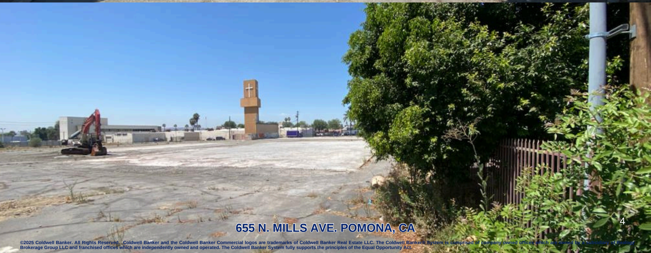
655 N. MILLS AVE. POMONA, CA