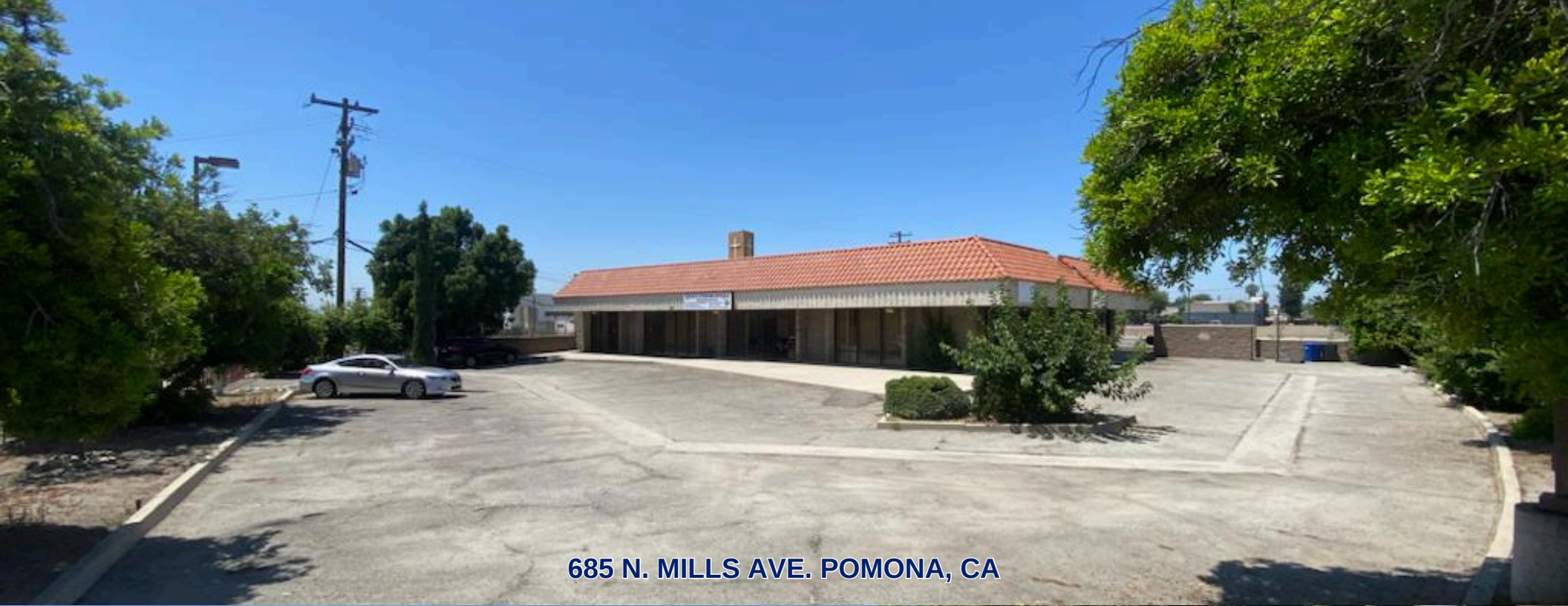
685 N. MILLS AVE. POMONA, CA