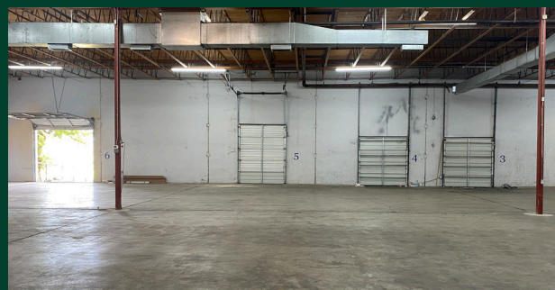
Interior - Ramp Door and Dock Doors