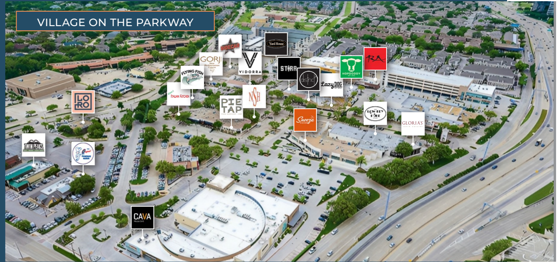
VILLAGE ON THE PARKWAY