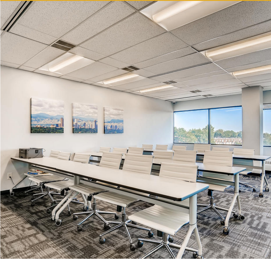
NEW BUILDING CONFERENCE ROOM