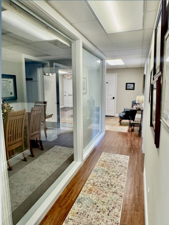
Hallway to front office