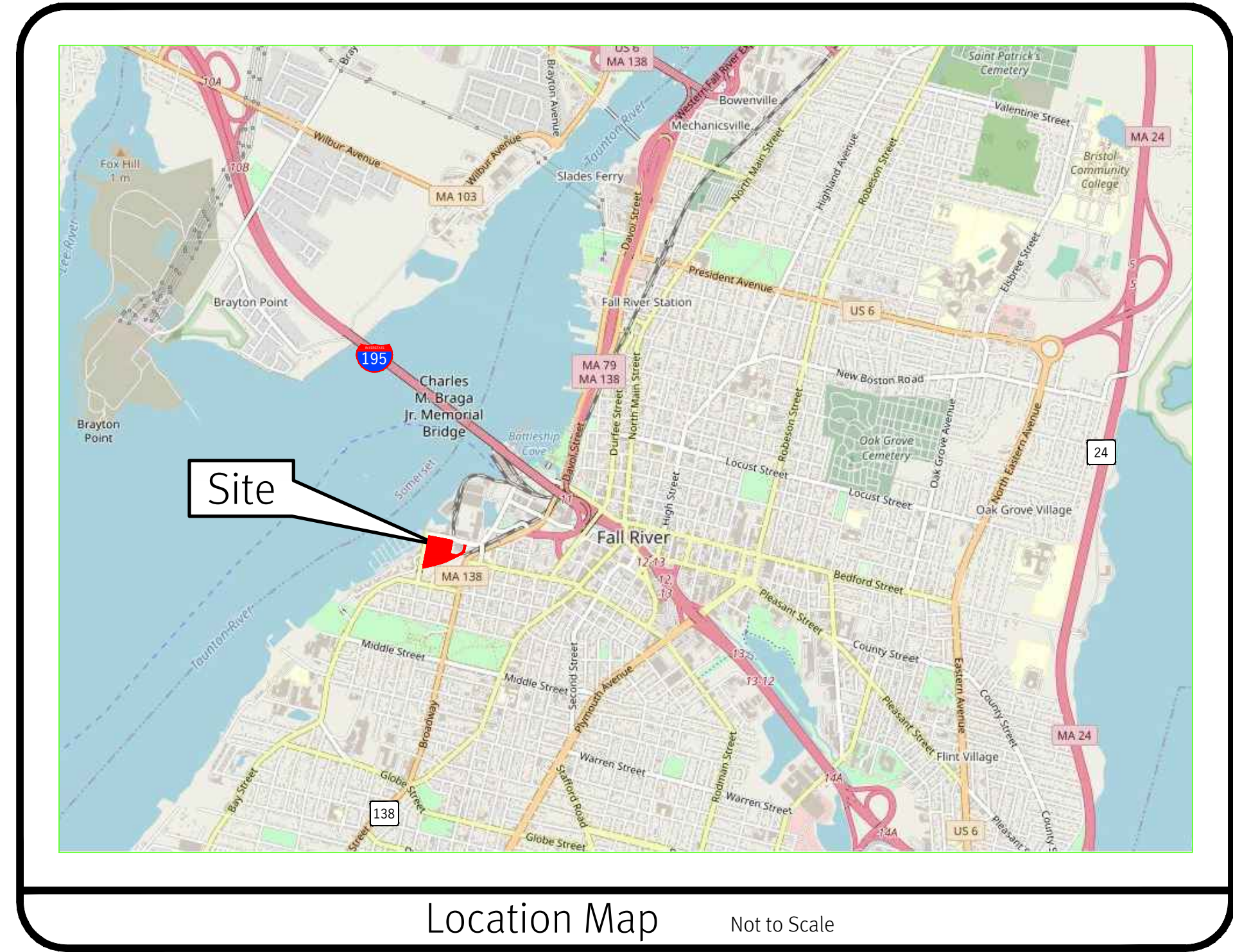
Location Map Not to Scale