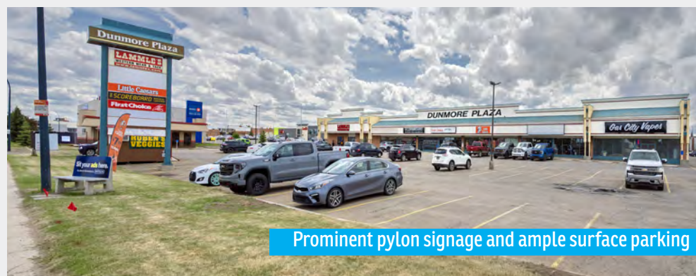
Prominent pylon signage and ample surface parking