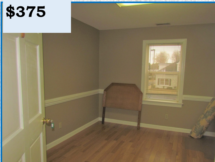
SUITE B 12 x 12