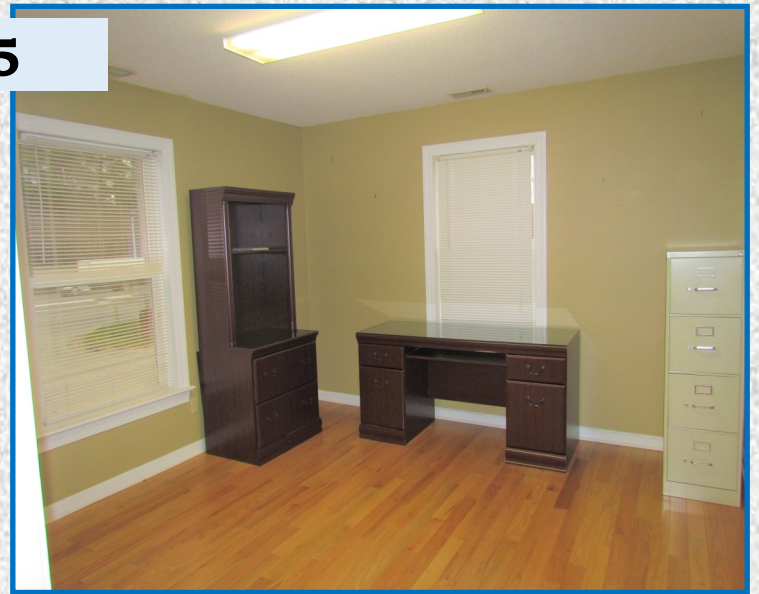
A 2 Office 14 x 9.6