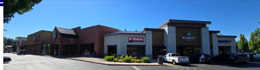
Planet Fitness, Wildwood Taphouse, Tigard Pet Supply, America's Best