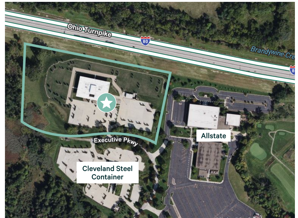
Property Aerial — 500 feet of frontage along I-80