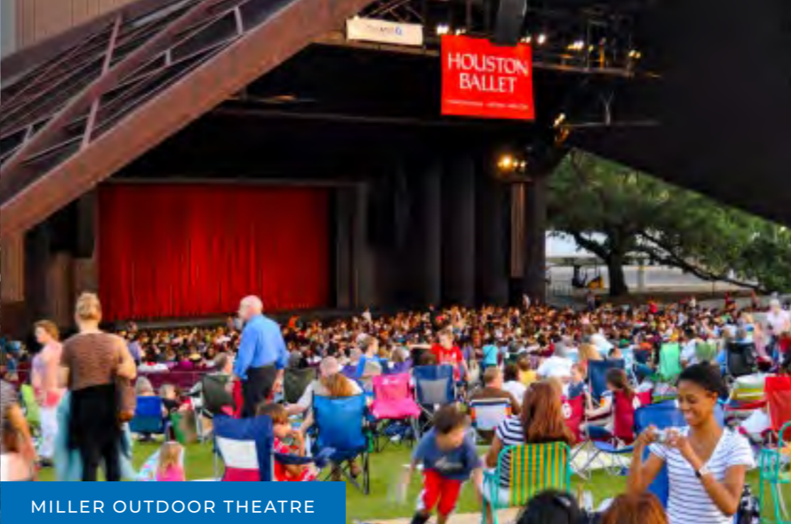
MILLER OUTDOOR THEATRE