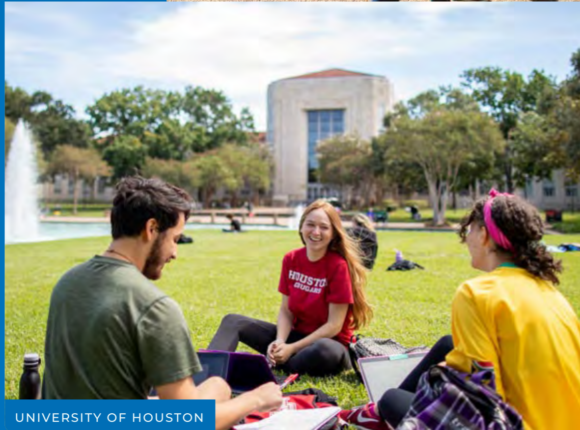
UNIVERSITY OF HOUSTON