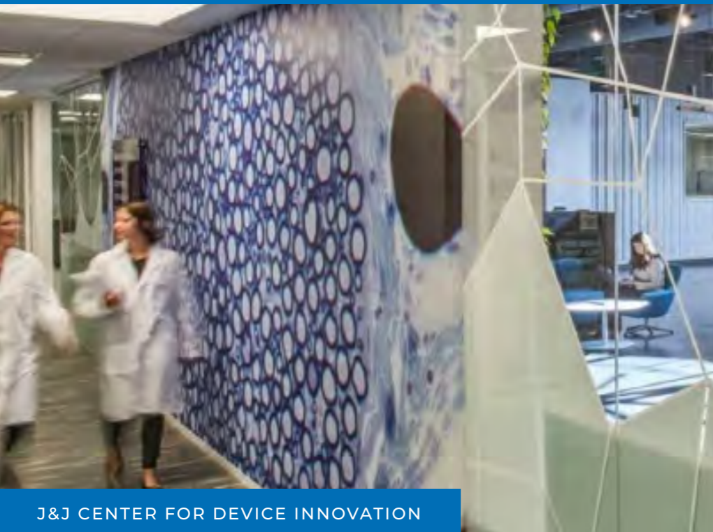
J&J CENTER FOR DEVICE INNOVATION