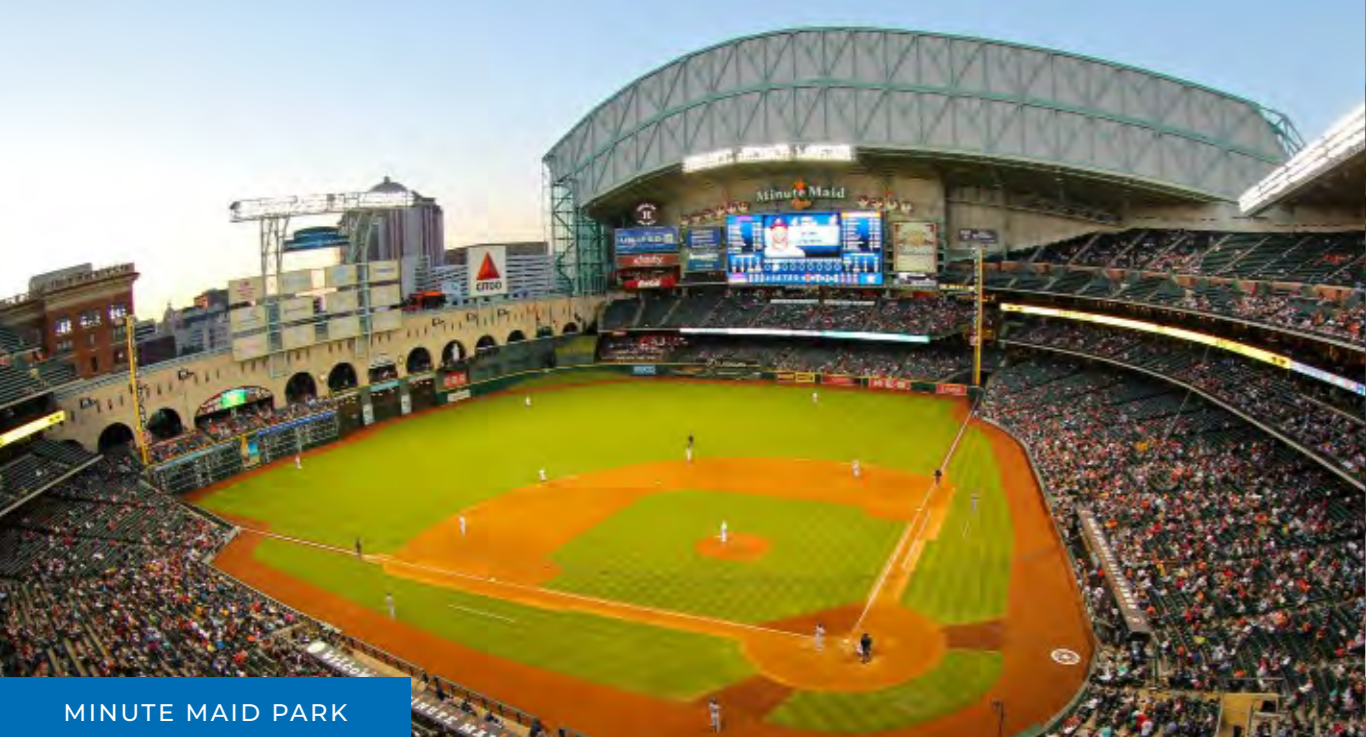
MINUTE MAID PARK