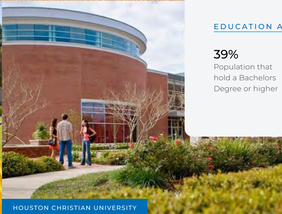
HOUSTON CHRISTIAN UNIVERSITY