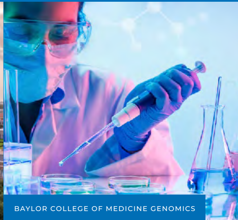
BAYLOR COLLEGE OF MEDICINE GENOMICS