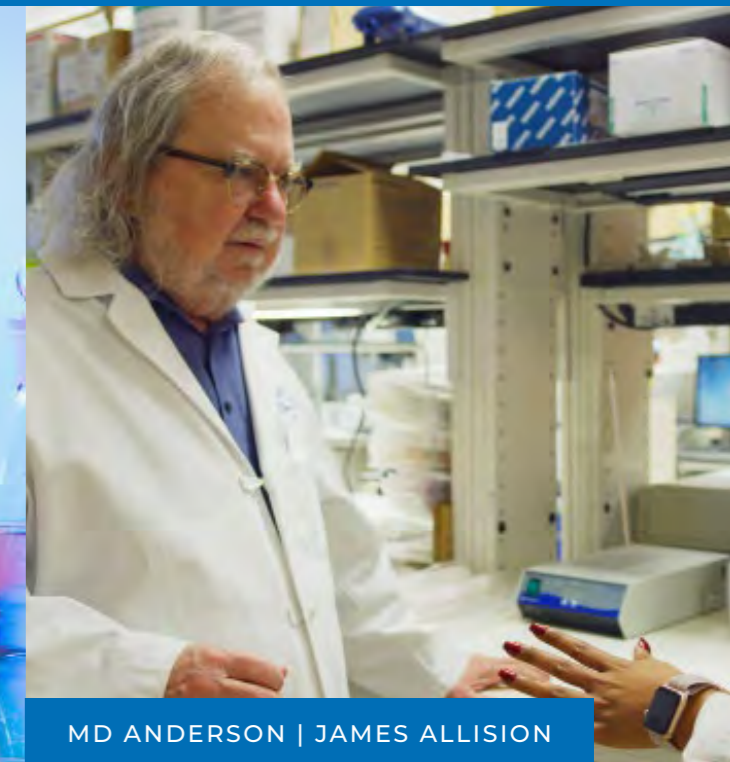
MD ANDERSON | JAMES ALLISON