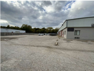
Property Photos (9 photos)