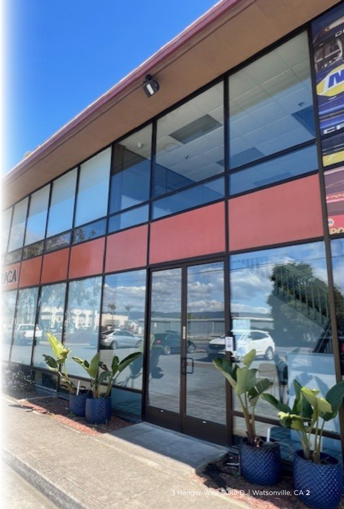
3 Hangar Way, Suite D. | Watsonville, CA 2