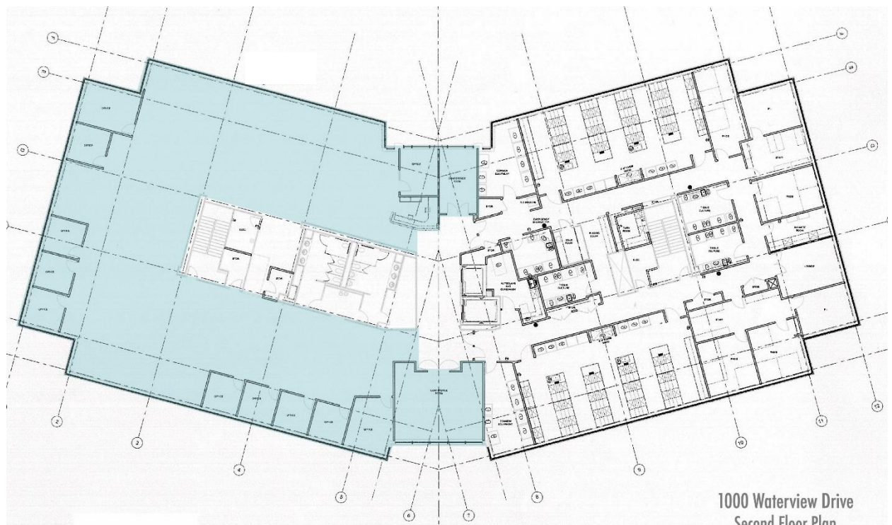
1000 Waterview Drive Second Floor Plan