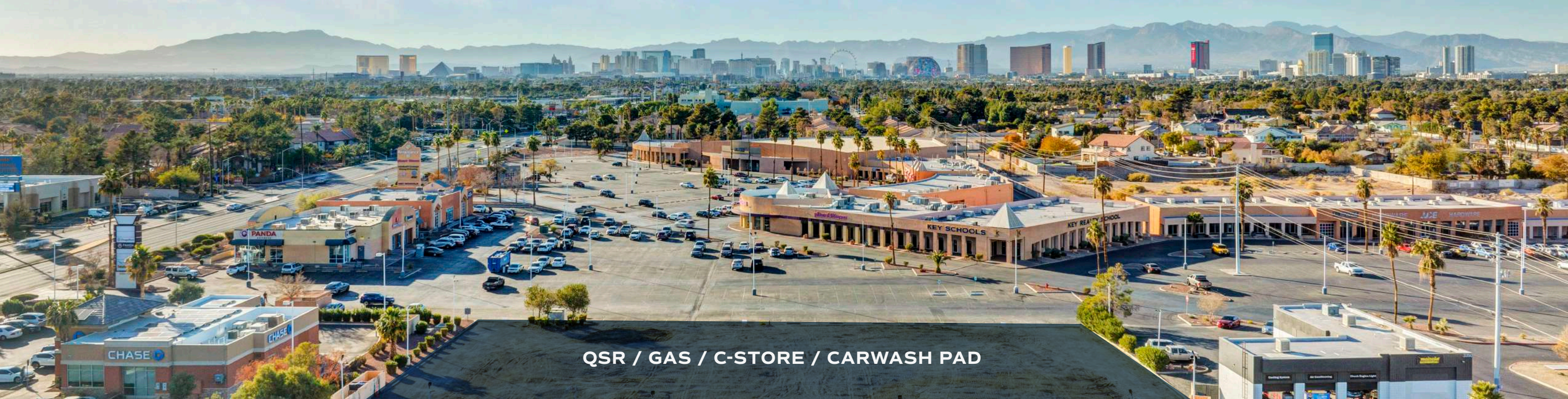
QSR / GAS / C-STORE / CARWASH PAD