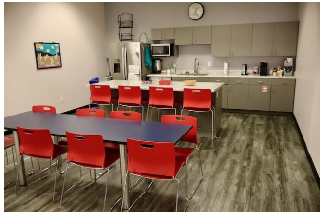
Kitchen & Dining Area

Covered Parking Available at $35/Stall per Month