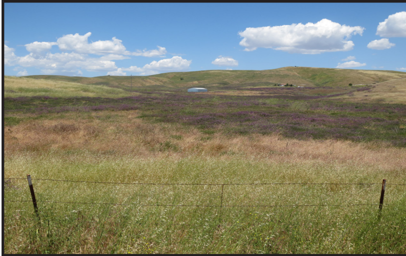
View for Camp 8 Road