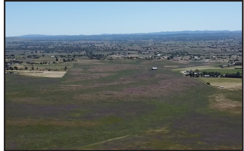
View from North Line