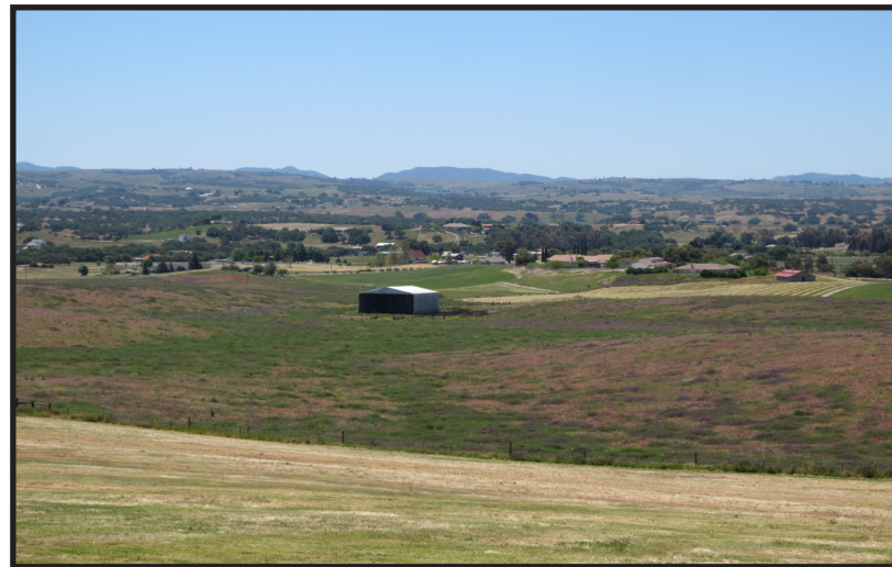
View from Northeast