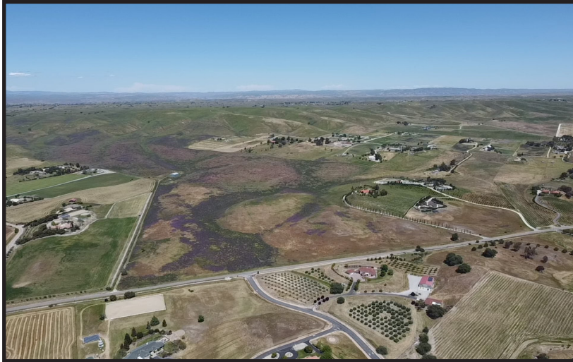
Aerial of Property from South