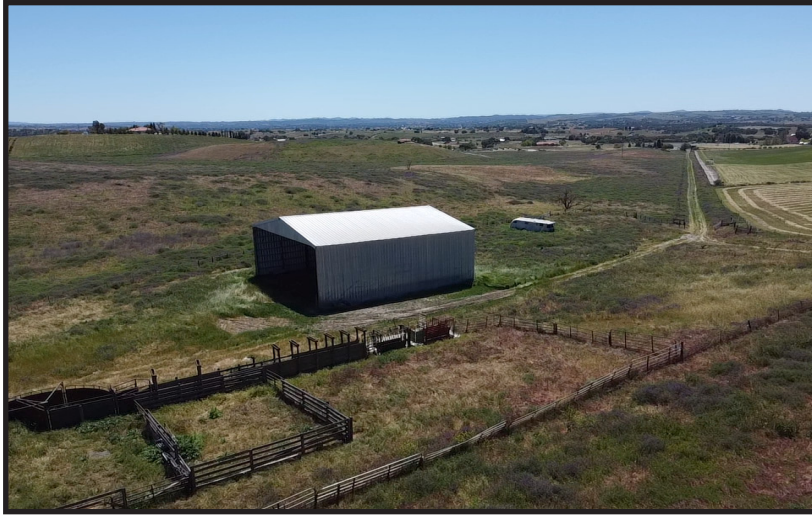
Barn and Corrals