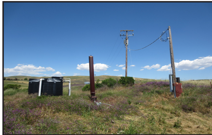
Well and Water Tank