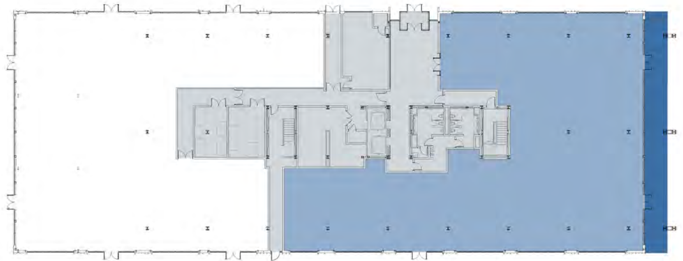
1ST FLOOR - 11,271 RSF 17' Clear Height