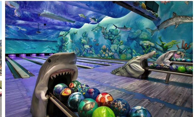
17,400 SF Uncle Buck's Fish Bowl Restaurant