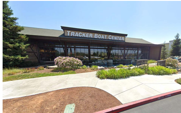
Outdoor Ponds for Fishing and Boat Demonstrations