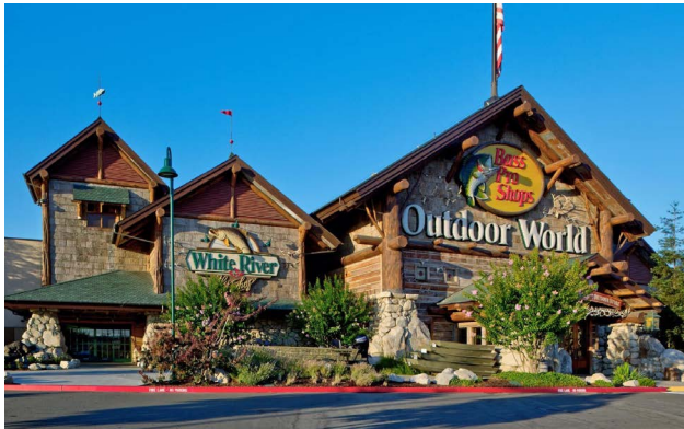
132,600 SF Bass Pro Shop Outdoor World