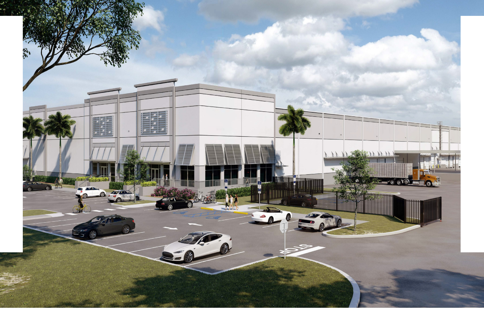
W. AIRPORT BLVD / MCCRACKEN RD, SANFORD, FL 32771