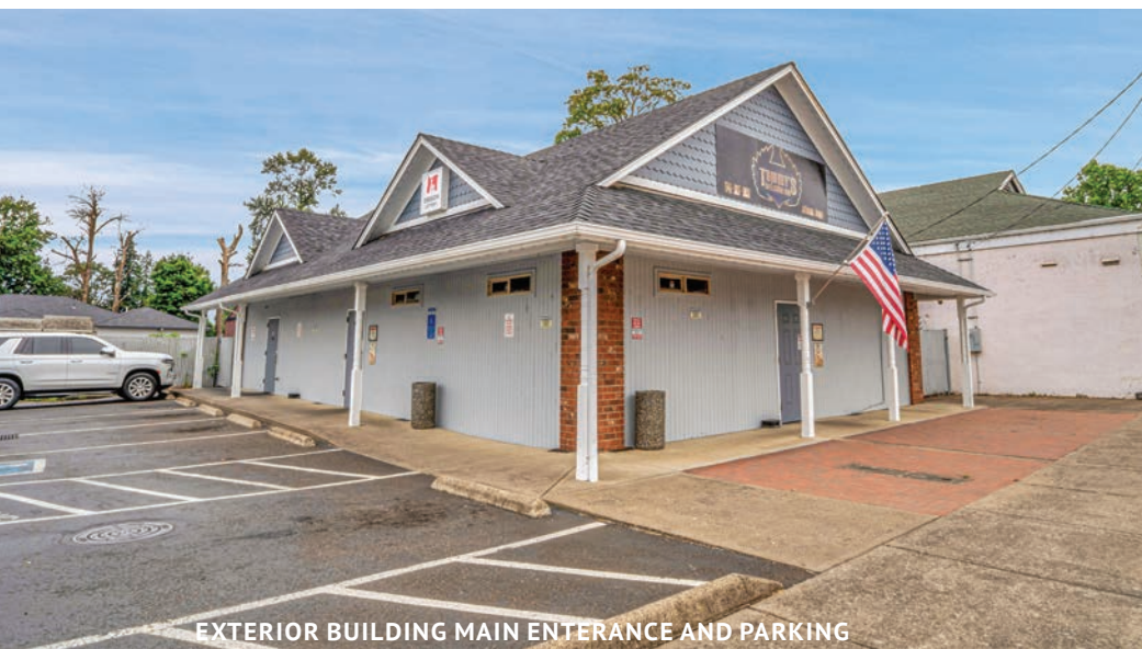
EXTERIOR BUILDING MAIN ENTERANCE AND PARKING