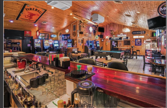
TOMMY'S WELCOME INN BAR