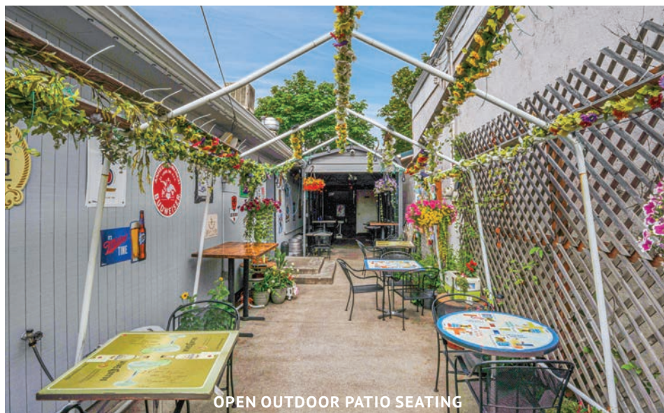
OPEN OUTDOOR PATIO SEATING