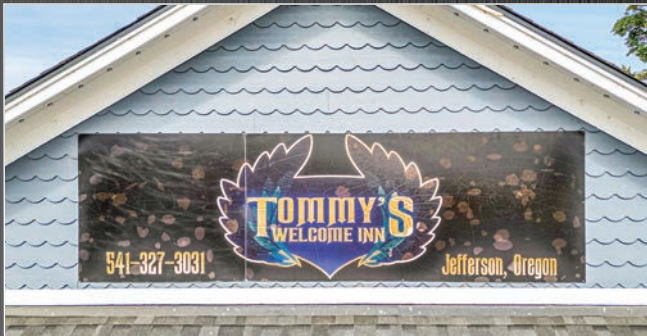
EXTERIOR TOMMY'S WELCOME INN