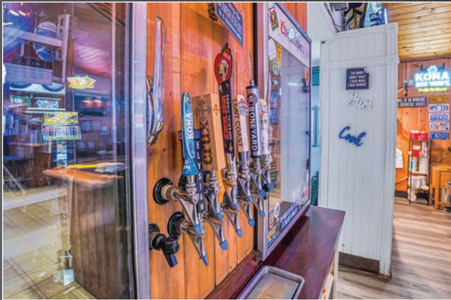
BEERS ON TAP