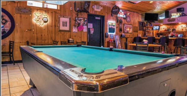
TOMMY'S WELCOME INN INTERIOR