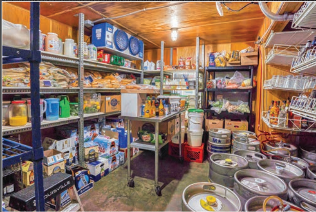
WALK IN COOLER