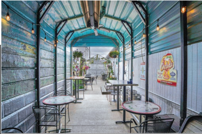
COVERED OUTDOOR SEATING