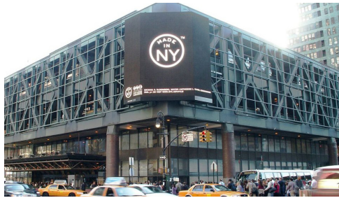
PORT AUTHORITY - 42ND STREET