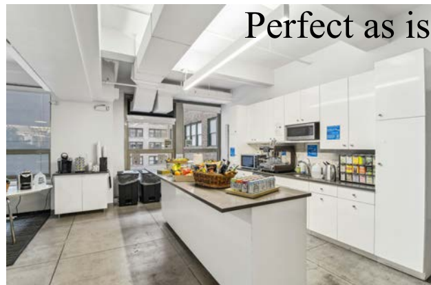
Perfect as is