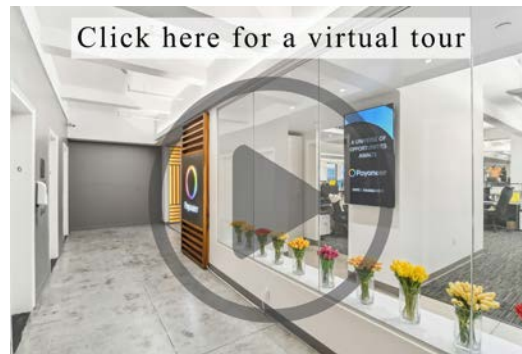
Click here for a virtual tour