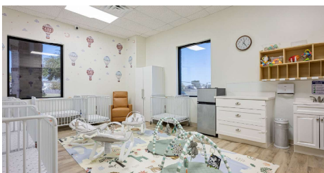
Infant / Nursery Room