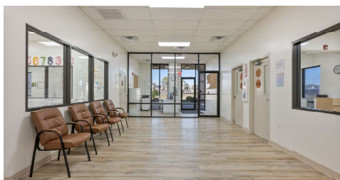
Reception & Lobby

A rare opportunity to lease a newly renovated, turn-key, move-in ready freestanding daycare center in Sugar Land's north market area. Fully sprinklered and ADA compliant, this premier property is ideally suited for a wide range of uses including daycare centers, private schools, tutoring academies, churches, adult day care, medical/therapy offices, and community services. Positioned adjacent to Barrington Place Elementary in Fort Bend County, the building features a secured fenced lot, carpool drive-thru, security system, prominent signage, and abundant natural light.