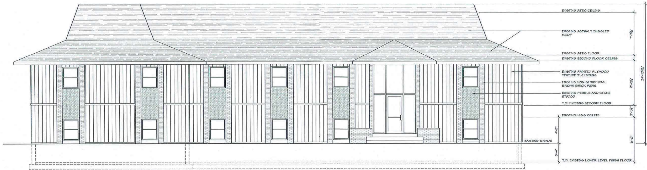
EXISTING NORTH ELEVATION (FRONT)