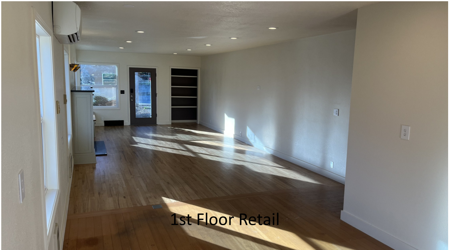
1st Floor Retail