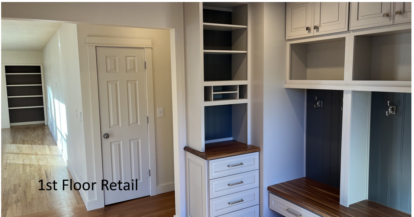
1st Floor Retail