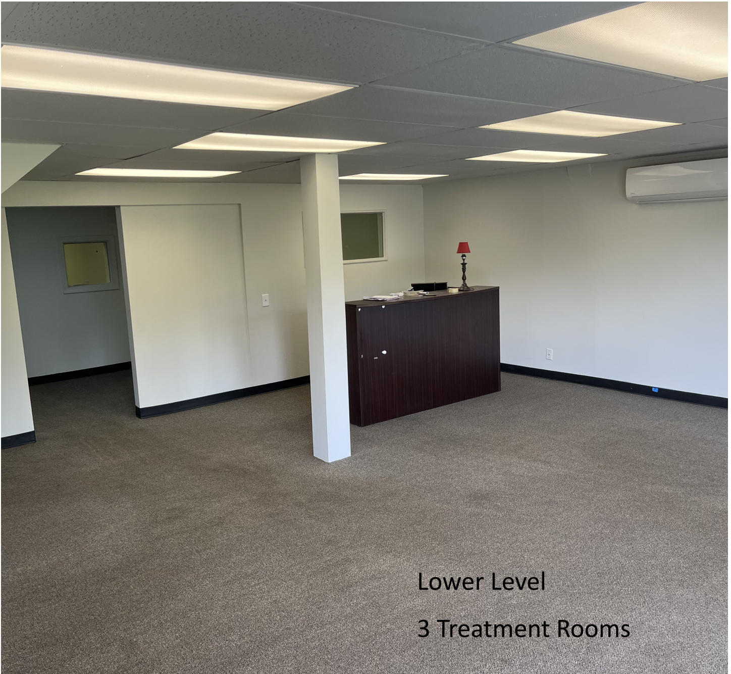
Lower Level 3 Treatment Rooms