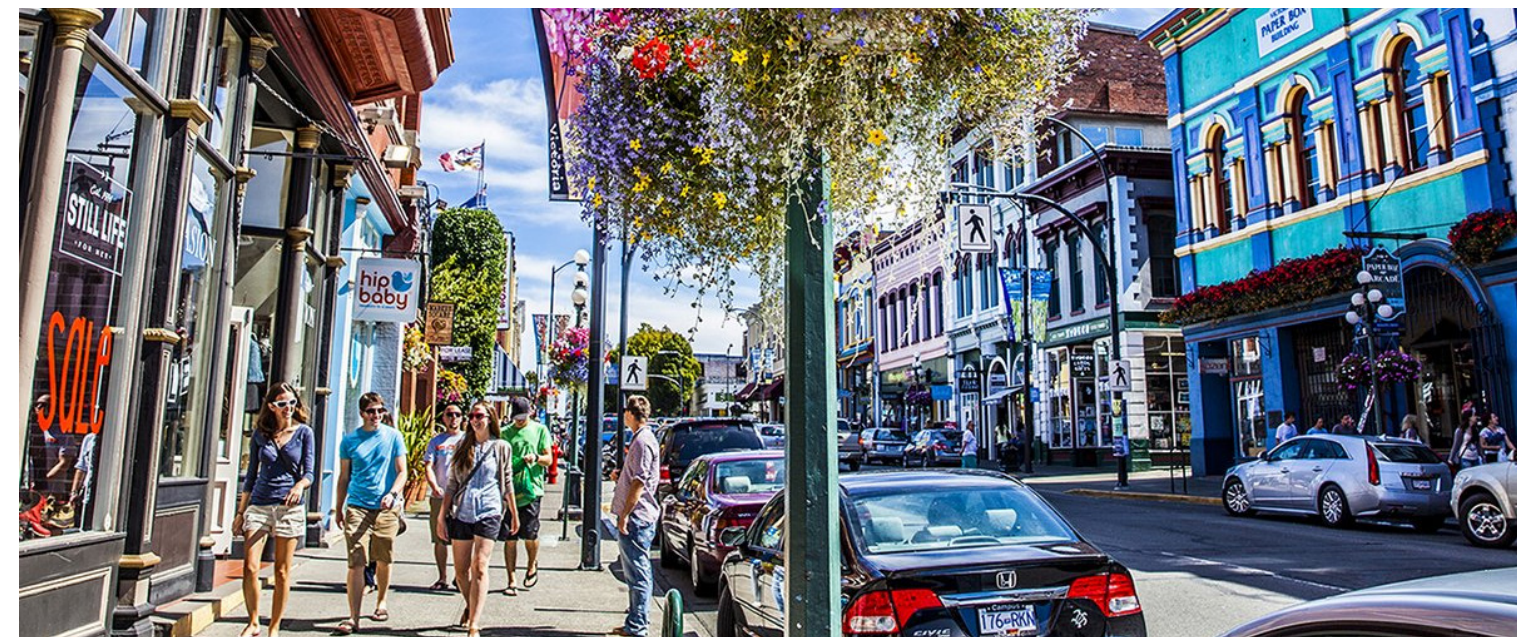
Street Level View From Lower Johnson St