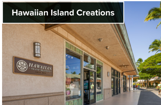
Hawaiian Island Creations