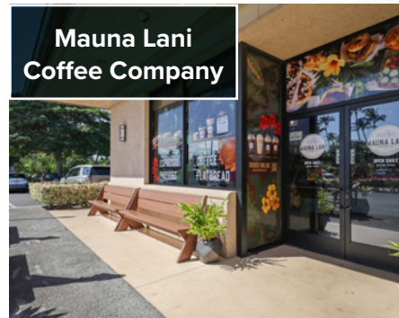
Mauna Lani Coffee Company