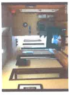
32-56 STEINWAY FRONT