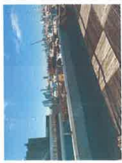
3256 STEINWAY REAR NYC CITY VIEWS