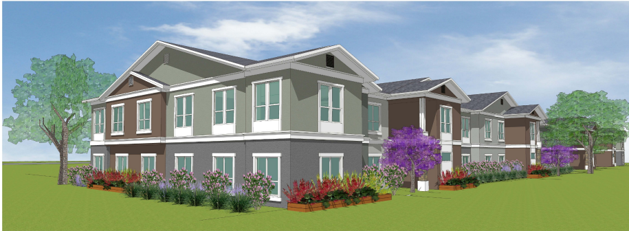
CAMEO DRIVE AFFORDABLE HOUSING NEVADA COUNTY, CALIFORNIA

AMEO DRIVE COUNTY OF NEVADA - CALIFORNIA