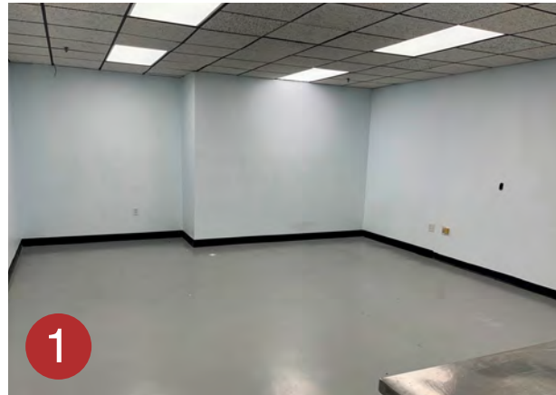
Main Level - Suite F: 450 SF