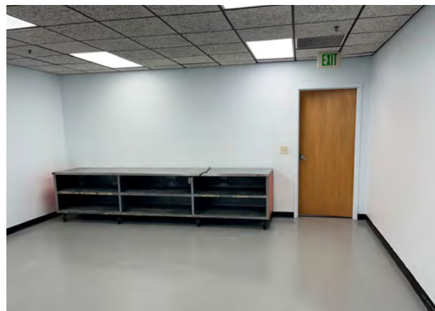
Main Level - Common Area Break Room