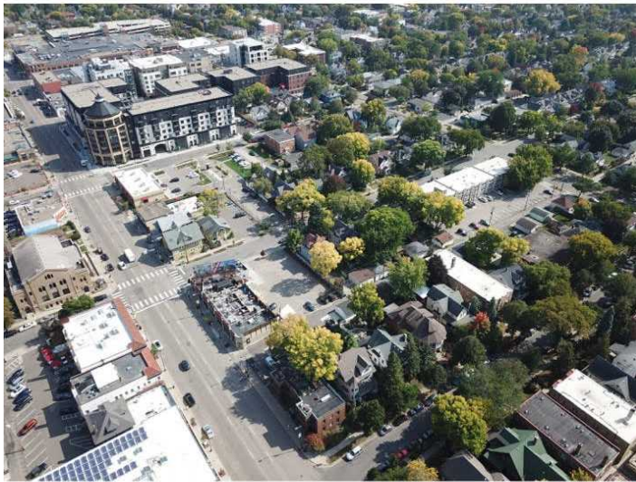
1623 W. Lake Street Project

Street Address: 1623 W. Lake Cross Street: James Avenue S Signal Intersection: Irving Ave. S & W. Lake Street Traffic Count: 17,080 VPD Area: 2 blocks W of Bde Maka Ska; Hwy 35W less than 1 mile Transportation: Nearby: Lake & E Bde Maka Ska Station