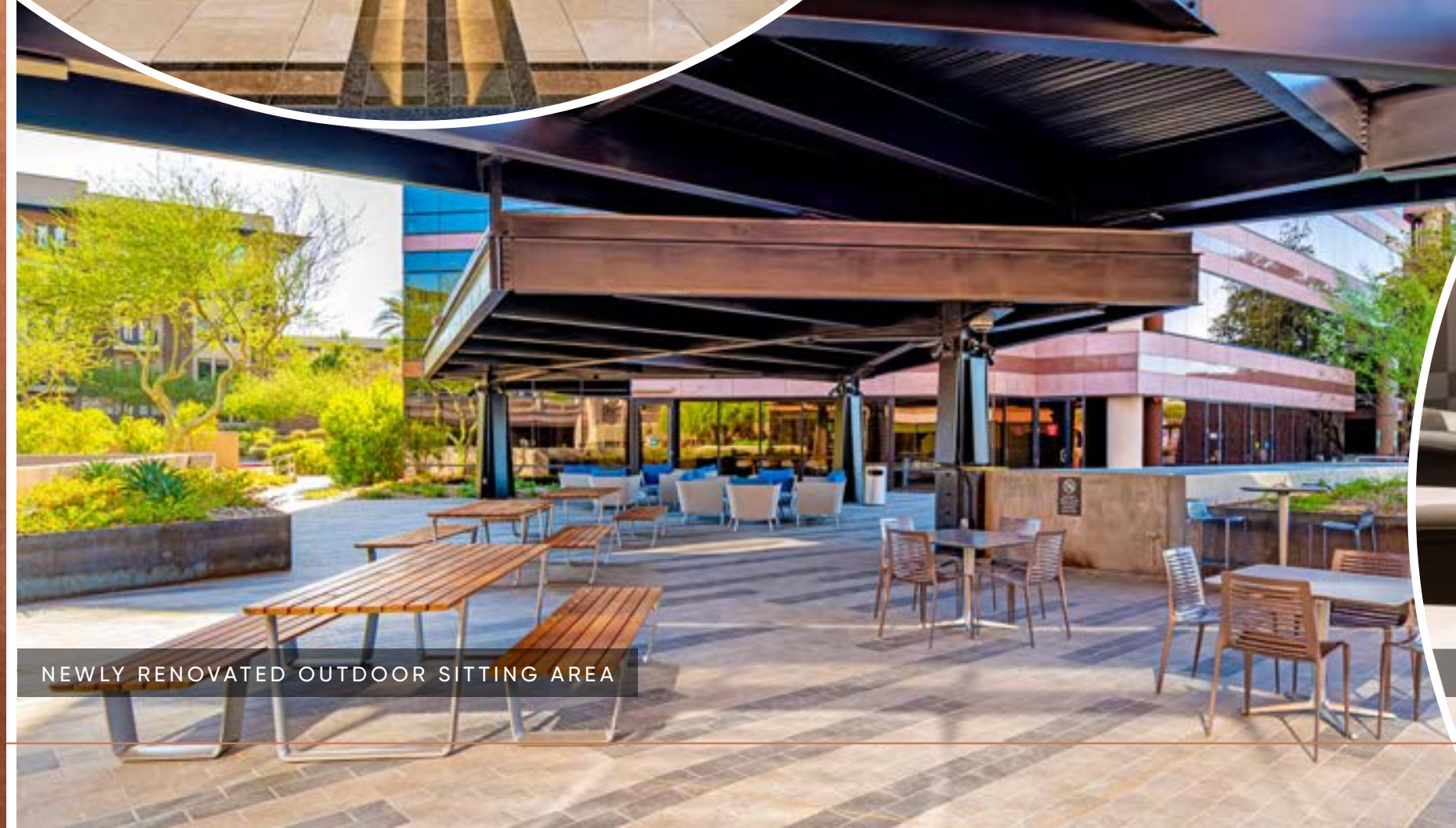
NEWLY RENOVATED OUTDOOR SITTING AREA