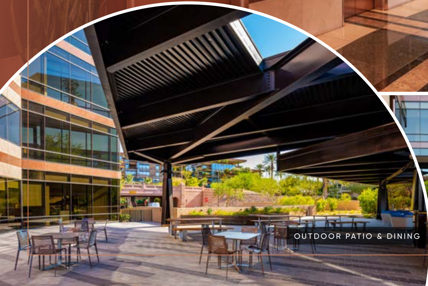
OUTDOOR PATIO & DINING